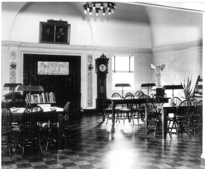
Reading Room with the original Grandfather Clock and the famous statue.

The following year a building committee was formed, and in 1929, at a cost of $30,000, the first of what would be two additions and one renovation was built onto the rear of the library. The contractors were a local firm, Munroe and Westcott. Finally, the children were to have their own room